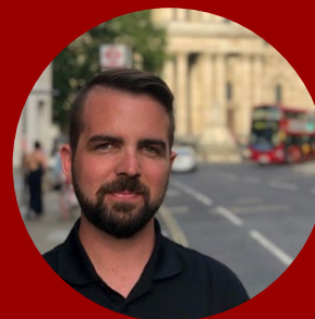
Logan Paul Bloomington