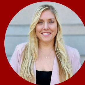
Lora Fox Enterprise Systems